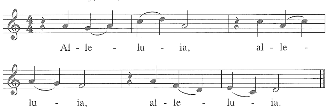
The English translation of the Sacramentary © 1973, International Commission on English in the Liturgy Corporation. All rights reserved. Music Copyright © 2011 by GIA Publications, Inc. • All Rights Reserved

I saw water flowing from the right side of the temple: alleluia (ref) It brought God's life and God's salvation, and the people sang in joyful praise: alleluia (ref) God called you out of darkness into the marvelous light: alleluia (ref) The world was washed of all its sin, all life made new again: alleluia (ref)